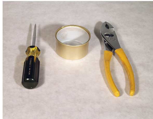
Fig 1: Required materials

The key materials necessary to build the Super Cat are shown below (Figure 1). Once these items are collected, the project should take only 10 or 15 minutes to complete.