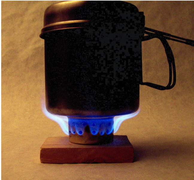
Fig 7: The Super Cat in operation

Wait 30 seconds or so to allow the flames to warm the stove and liquid alcohol, during which time you'll note an increase in heat output. After this brief warm-up period, place your pot or other cooking container directly on top of the stove, making sure that it both covers completely, and is centered over, the top stove opening. With the pot in place, the combustion chamber should now pressurize and the flames should shift from emanating from the top of the stove to emerging from the side vent holes.