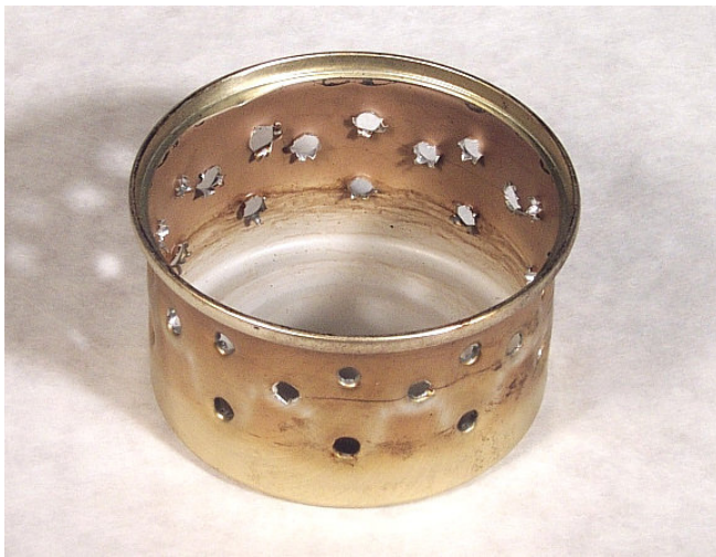
Fig 3: Vent holes before flattening collars

When the holes are punched, you'll notice a ragged-edged "collar" around each hole inside the can. These collars can create turbulence in the flame jets, so it's best to flatten them in order to get the smoothest possible gas flow. Use a pair of pliers with curved pinchers (so that you don't also flatten the can rim), to gently "smash" down these edges. The photos below illustrate the process. Your Super Cat is now ready to test.