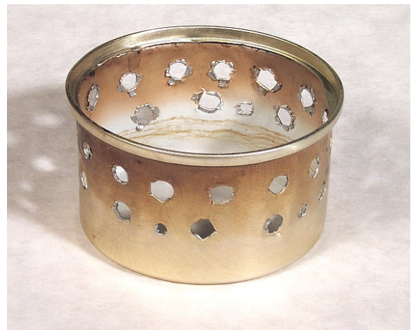
Fig 5: Completed stove (this one with 4 extra vent holes)