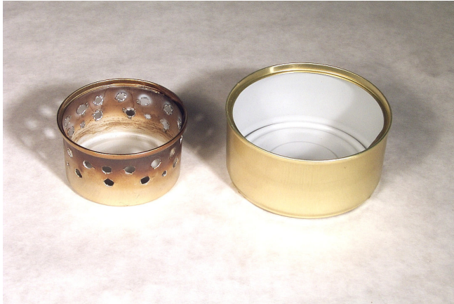
Fig 8: Super Cat stove with “snuffer cup”

When this fry pan is used as a snuffer, the flame goes out in a second or two. You can also make a dedicated “snuffer cup” from any lightweight aluminum can that is slightly larger than the stove. A standard 5.5 ounce pet food can works perfectly and weighs only about ½ an ounce.