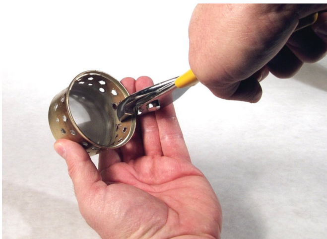
Fig 4: Flattening vent hole collars