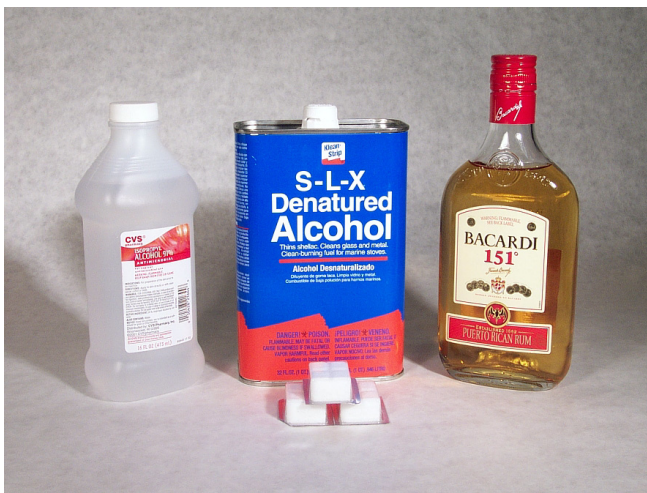
Fig 9: Fuels tested

In the course of testing the stove thus far, I have tried four kinds of fuels. The best results have come from denatured alcohol, which burns hot and clean with virtually no odor or soot production. Denatured alcohol is widely available; the type I used was found in the paint department at Wal-Mart and cost $3.67 a quart.